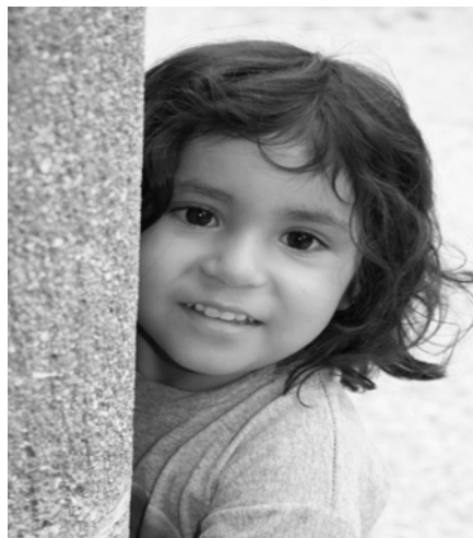
A small child watching the runners

Blister update: still painful – now blisters on top of blisters.