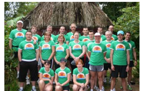
The Team Run, Mexico 2008

After a very long flight, Gatwick to Houston (10 hour flight) – Houston to Cancun (3.5 hour flight) and then a 3 hour coach transfer to a remote part of Mexico by the name of Izamal. By the time we arrived in Izamal we were all shattered and the running had not even started.